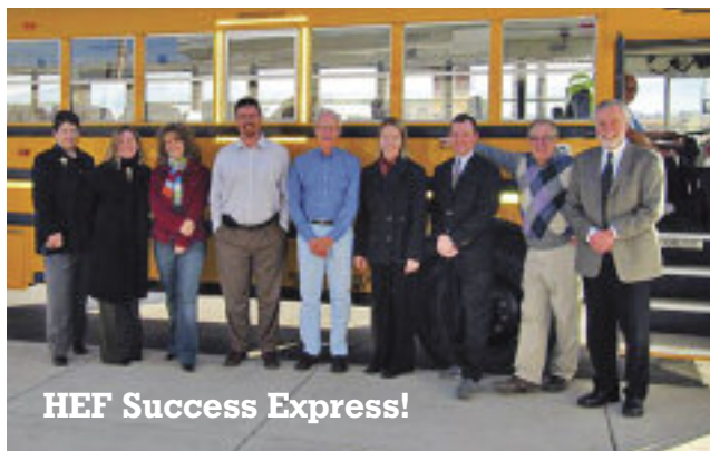
HEF Success Express!