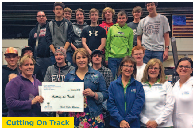
Cutting On Track