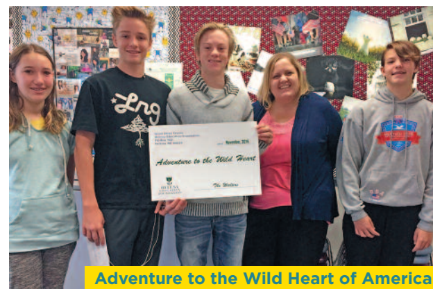
Adventure to the Wild Heart of America