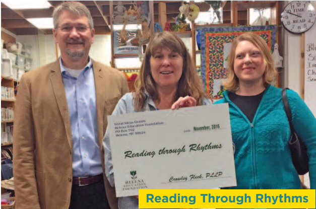
Reading Through Rhythms