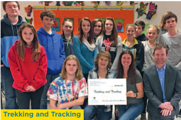
Trekking and Tracking