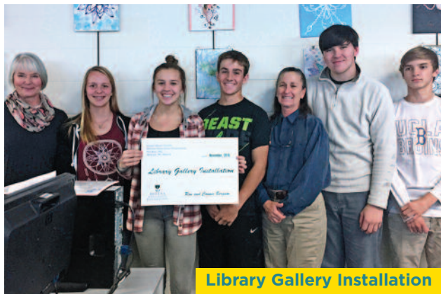
Library Gallery Installation