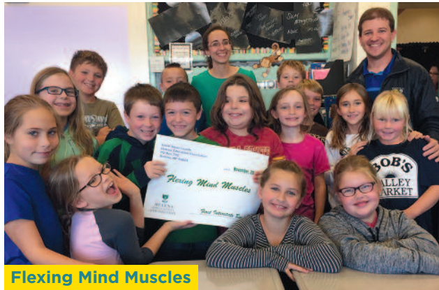
Flexing Mind Muscles

Creating Connections fosters an eagerness to learn about other regions and cultures. Students will interview individuals from around the world in person and via Facetime/Skype to explore a wide range of human experiences. Students will also develop their active reading and critical thinking skills by reading memoirs, biographies and novels to illuminate personal struggles on a broader political and social landscape. Funding will support guest speakers, authors and a variety of books for each class.