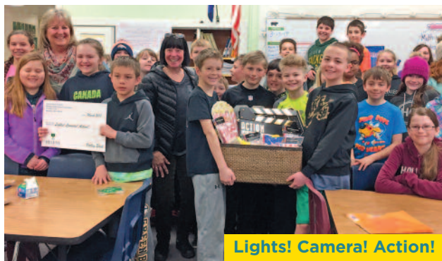
Lights! Camera! Action!