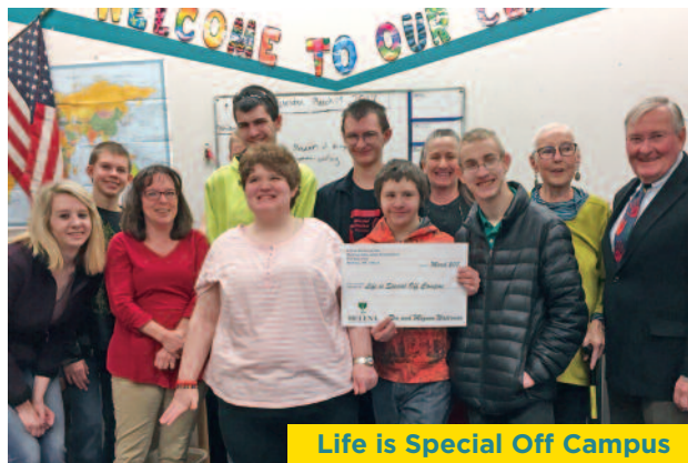
Life is Special Off Campus