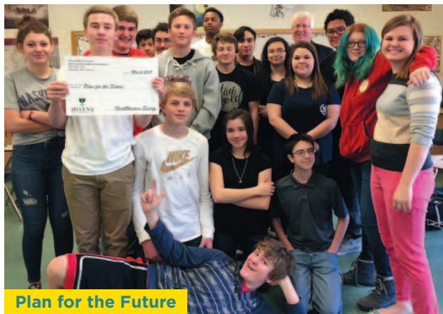
Plan for the Future