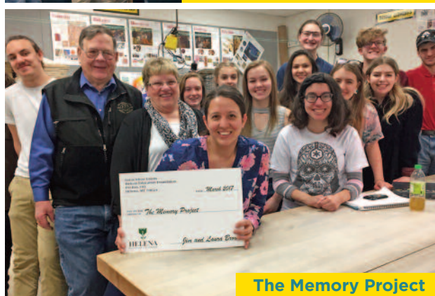
The Memory Project