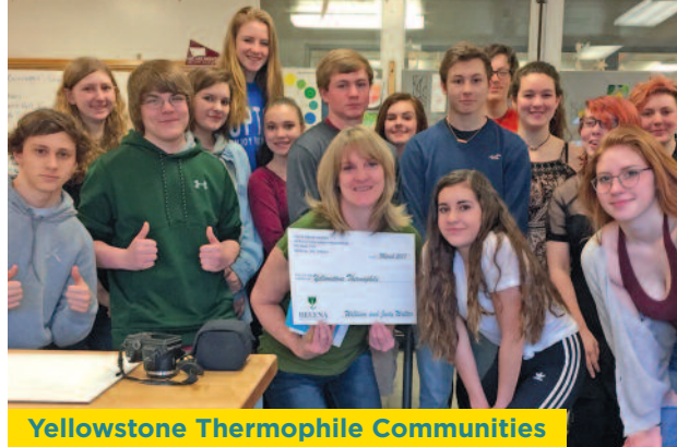
Yellowstone Thermophile Communities

Thank you to the HEF Spring 2017 grant sponsors: