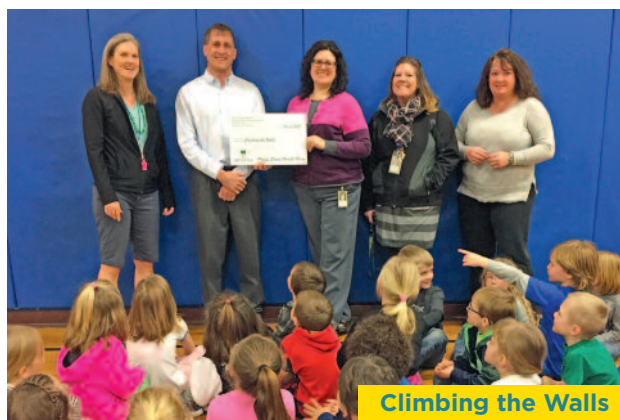
Climbing the Walls