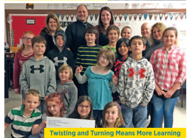
Twisting and Turning Means More Learning

To date, the Helena Education Foundation has awarded 322 grants, totalling more than $613,801 and involving more than 85% of Helena's teachers!