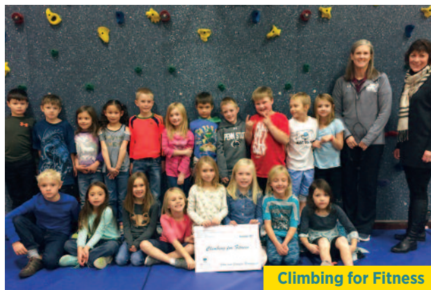
Climbing for Fitness