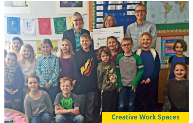
Creative Work Spaces