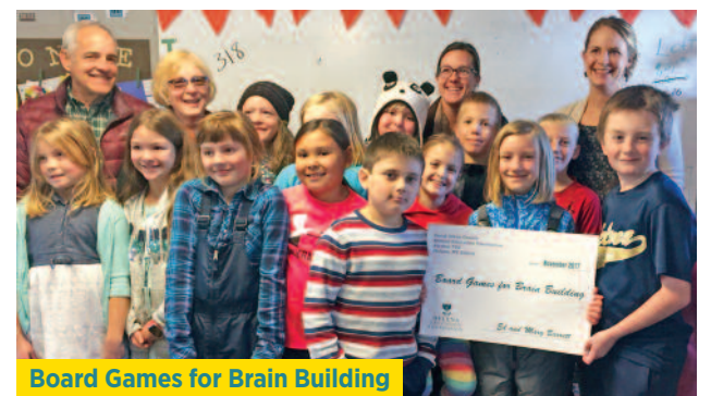
Board Games for Brain Building