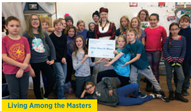
Living Among the Masters