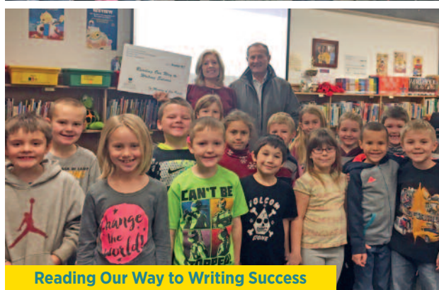
Reading Our Way to Writing Success