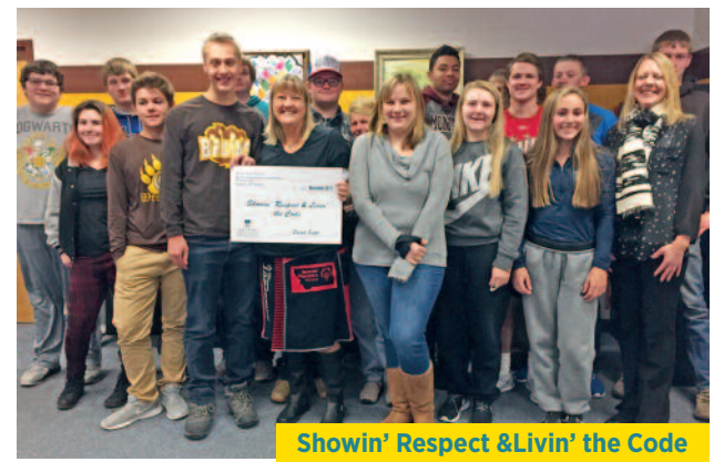
Showin' Respect & Livin' the Code